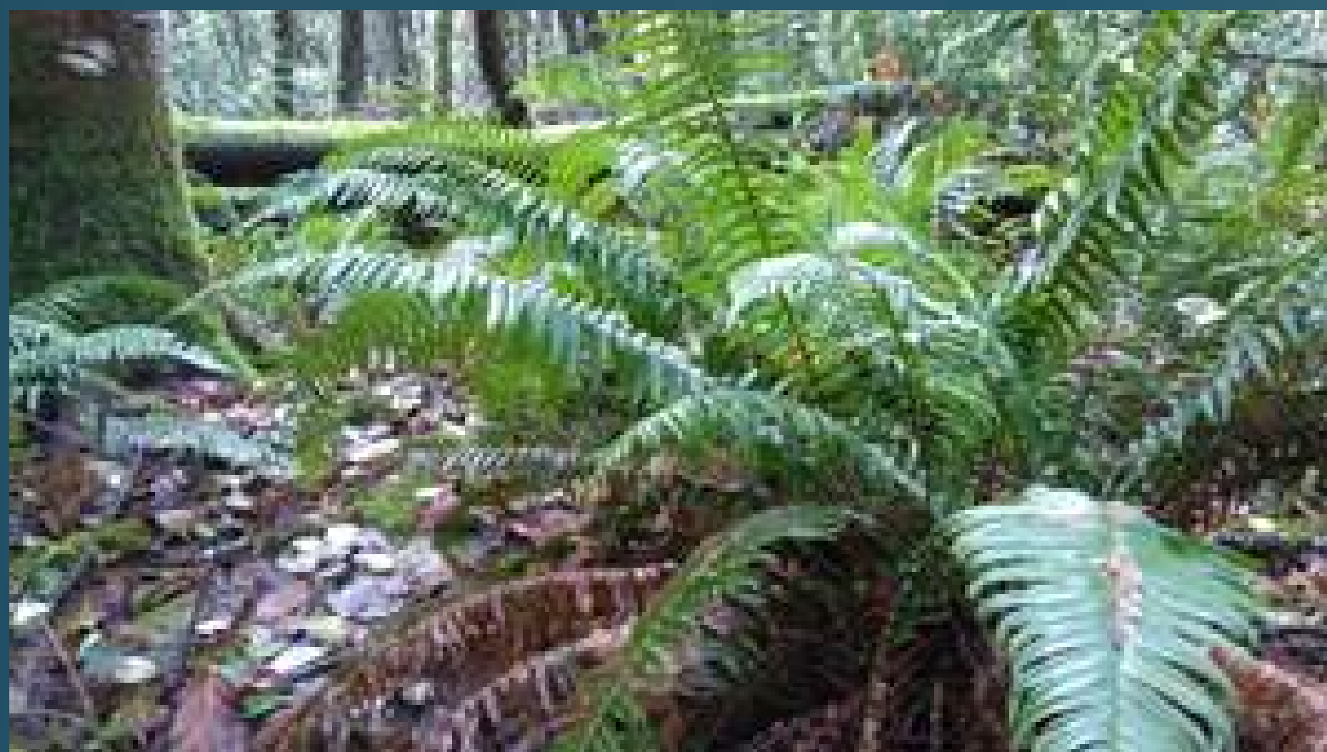
Western sword fern (Polystichum manitum)

Western sword fern, Dull Oregon-grape, salal, and western trillium are some of the native plants that can be found throughout the Saanich Peninsula. Explore your neighbourhood or an accessible local park to see if you can spot any! Snap a picture or sketch your rendering when you find one. Be courteous and remember social distancing expectations of giving space when passing others.