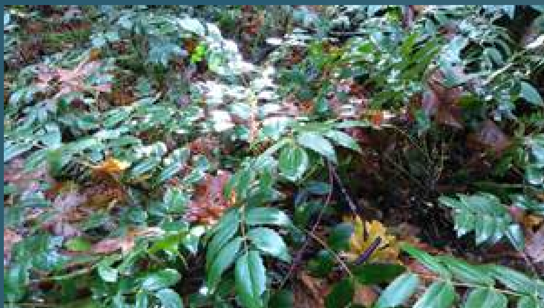
Dull Oregon-grape (Mahonia nervosa)