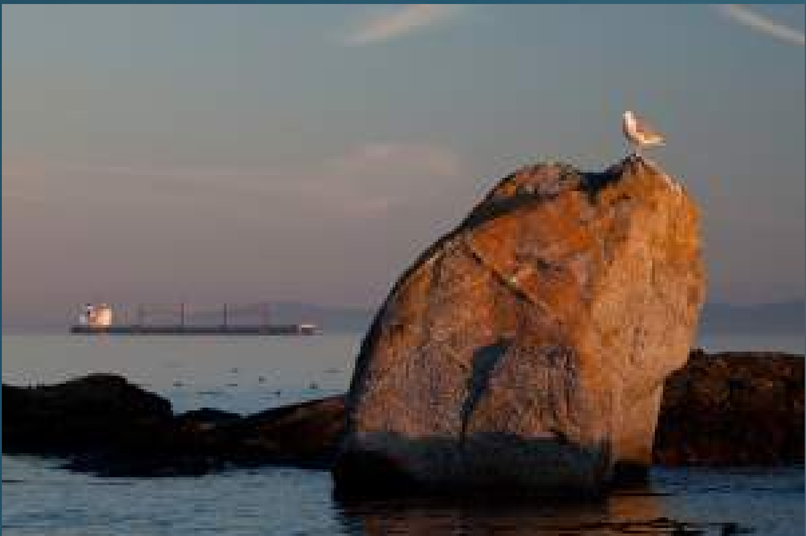
Photo: Example of Glacial Erratic in Oak Bay called: The Harling Point erratic.

Your challenge is to find this glacial erratic and take a photo of it! However, please do not climb on, or touch, this erratic. Remember to be courteous while on the path and step aside as needed to allow others to pass. (Point 9)