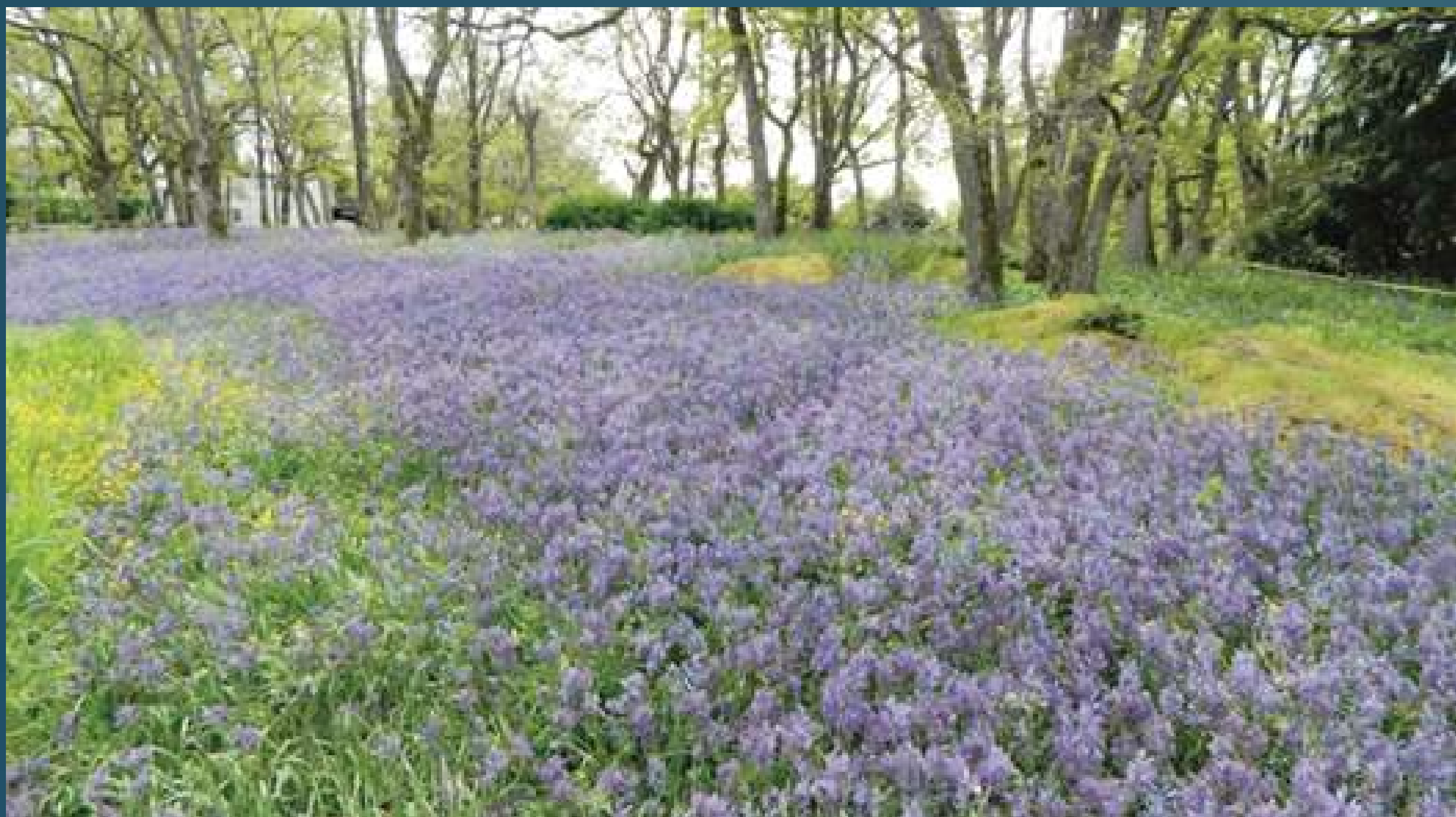
Photo of Playfair Park

Camas, which blooms blue/purple beginning in the spring and into June, used to cover much of Victoria as part of the Garry Oak Meadows that dominated the landscape. Camas can still be found at many greenspaces around Greater Victoria, included at such nearby hidden gems as Playfair Park where a large meadow blooms.