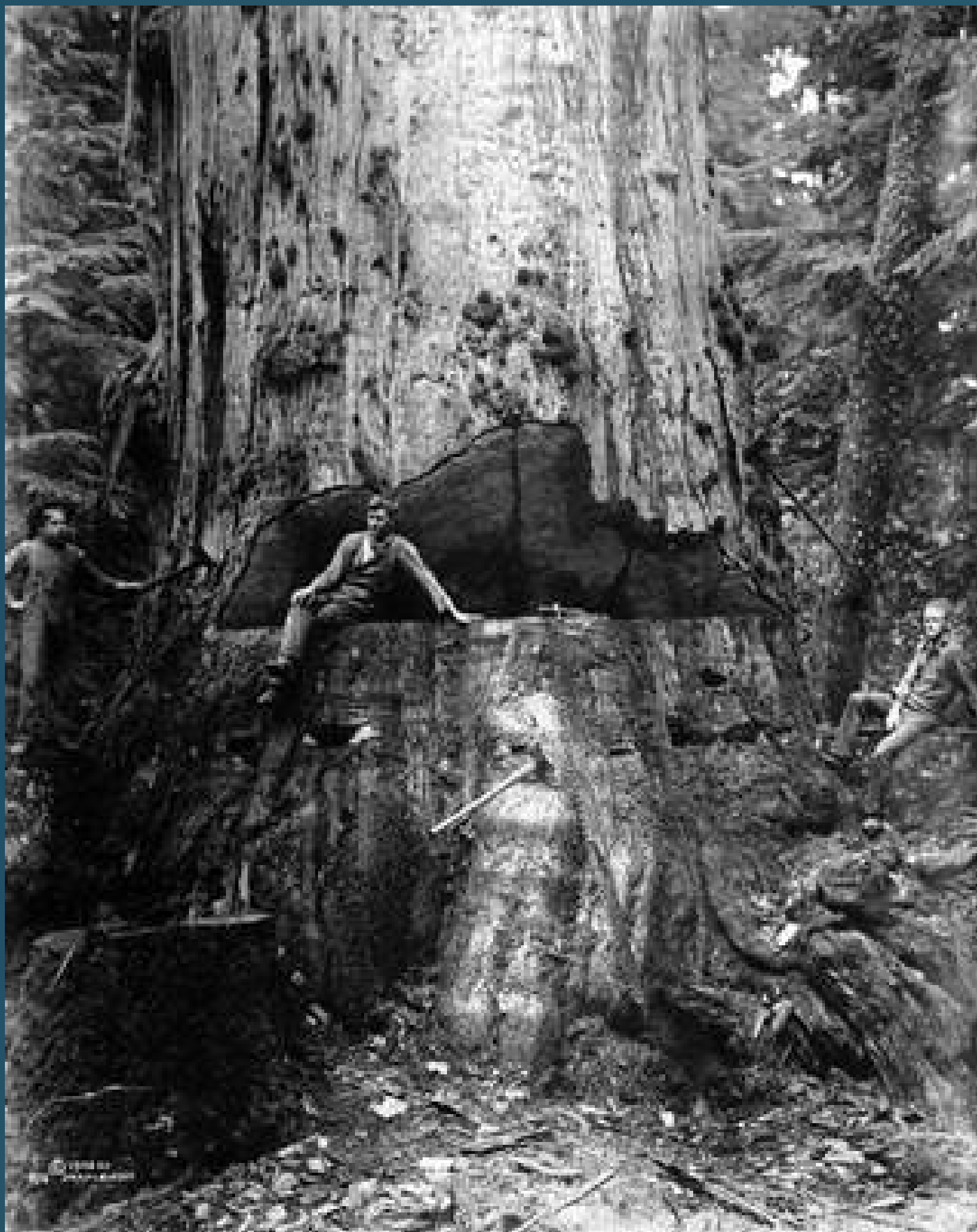
An early photo of Pacific Northwest logging of large cedar trees.

“Cycle up a local hill which you’ve found daunting in the past. Since Camosun is near Mt.Tolmie, cyclists may wish to cycle up to the top and enjoy a nice view and pleasant ride down the other side (remember to make sure your brakes are in working order!). Other nearby hills to conquer include Cedar Hill Cross Road between Richmond and Gordon Head Road, and Foul Bay Road just south of Landsdowne Road. Take a photo once your ride has been conquered.